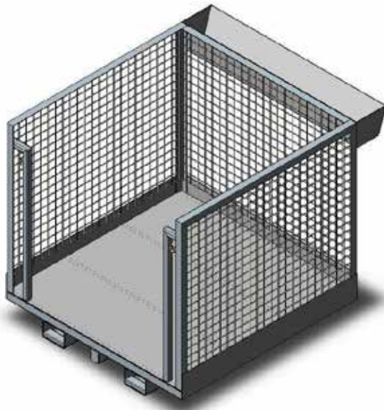
(Standard Cage with Parcel Tray shown)

*** Manufactured strictly in accordance with Australian Standard AS 2359.1, the type WP-OP Order Picking Cage must only be lifted by a dedicated 'Order Picking Forklift'. The load capacity of the Forklift will restrict the actual load capacity of the Order Picking Cage.