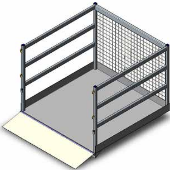
(safety chains not shown)

The type WP-GC12 Forklift Goods Cage has been designed as a storage and transport Cage suitable for furniture and whitegoods. A hinged ramp is standard allowing furniture trolleys access into the Cage. Locking the ramp in the vertical position and attaching the 2 safety chains across the front secures goods inside the Cage. This cage is manufactured strictly in accordance with Australian Standard AS 2359.1. The standard finish on the cage is painted enamel.