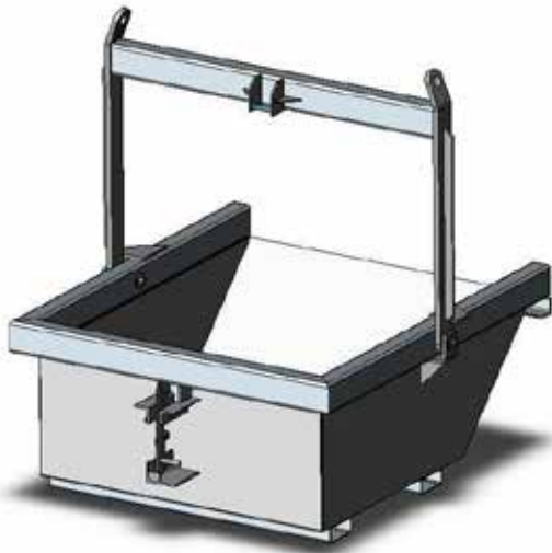
(Standard BWB-15 model shown)

For capacities greater than 3.0 Tonne please refer to the type BWB-30 Bulk Waste Bin specifications.