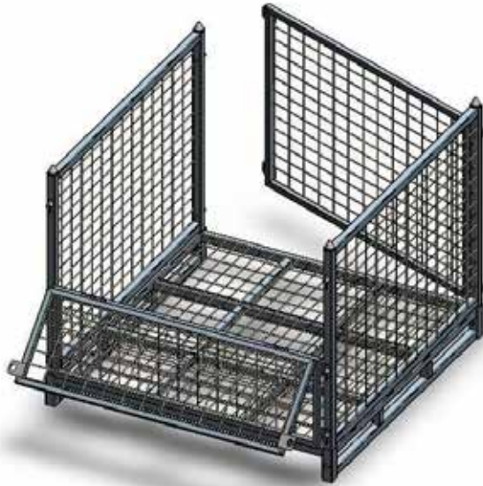
(Front Top Frame & Rear Frame shown in Open position)

This multi-use pallet size cage is designed to suit all warehousing and storage requirements with the advantage of being quickly dismantled for valuable space saving and transport efficiency. This durable, economical cage can be transported by Forklift or Pallet Trolley and can be stacked up to 4 high when empty and 2 high when loaded. Front drop down gate and rear hinge gate are both removable and are able to be opened for easy access, even when stacked. Optional galvanised sheet metal flooring which fits over the existing mesh Base Frame, is available upon request.