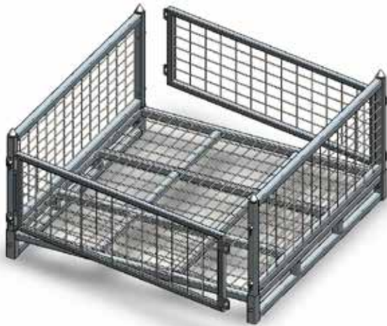
(Front & Rear Gate Frames shown in Open position)

This multi-use pallet size cage is designed to suit all warehousing and storage requirements with the advantage of being quickly dismantled for valuable space saving and transport efficiency. This durable, economical cage can be transported by Forklift or Pallet Trolley and can be stacked up to 4 high when empty and 2 high when loaded. Front and rear hinged Gates are both removable and are able to be opened for easy access, even when stacked. Optional galvanised sheet metal flooring which fits over the existing mesh Base Frame, is available upon request.